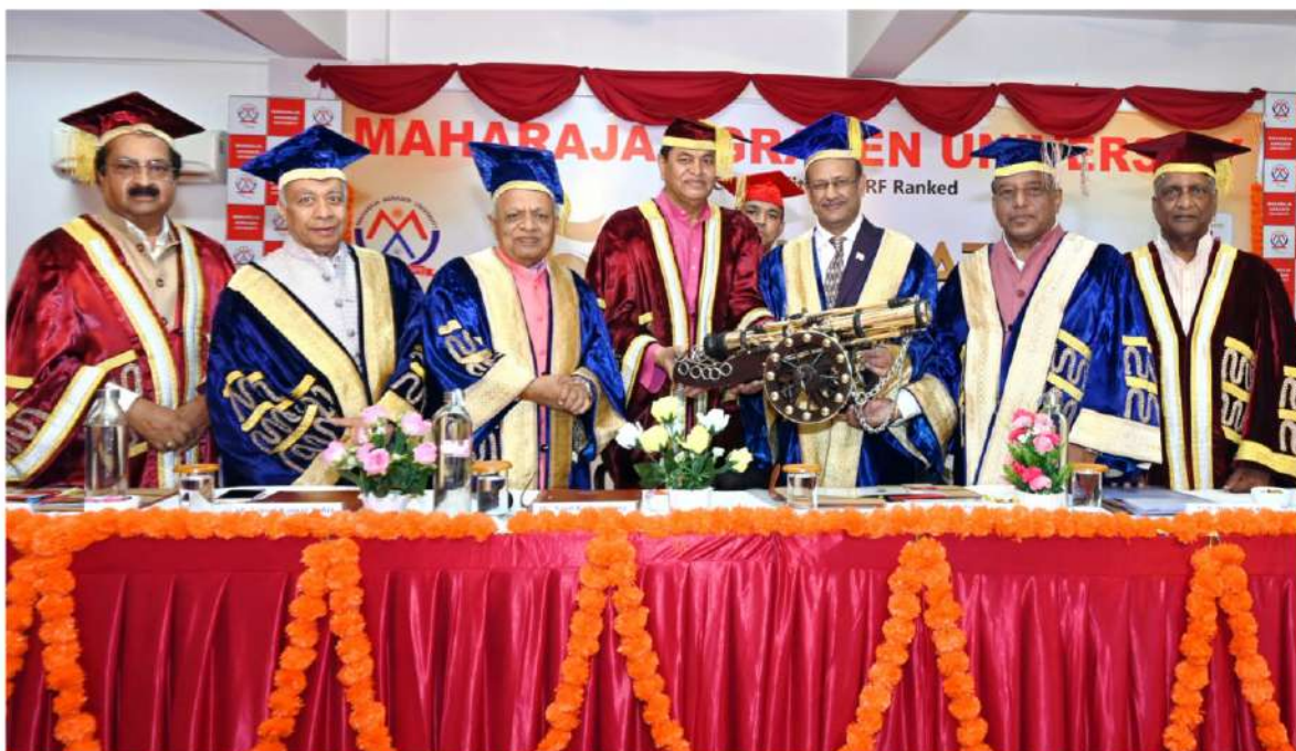
5th Convocation - Chief Guest Hon'ble Mr. Justice Rajesh Bindal, Supreme Court of India (27th April 2024)