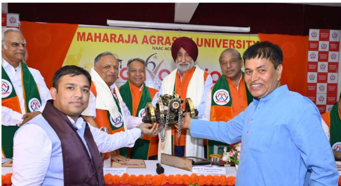
6th Convocation - Chief Guest Hon'ble Mr. Justice Virender Singh, Judge, High Court of Himachal Pradesh Shimla (15th June 2025)